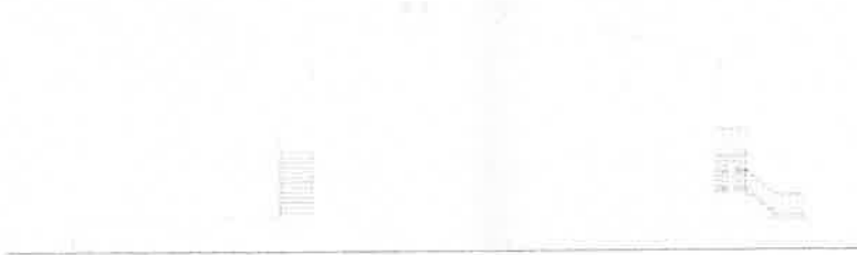
ALÇADO LATERAL ESQUERDO